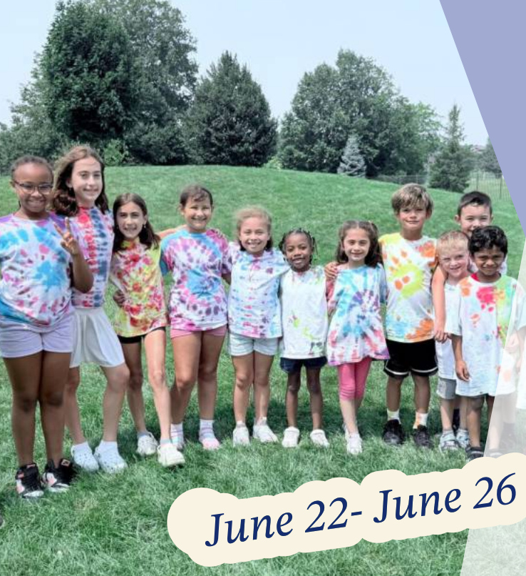
June 22- June 26