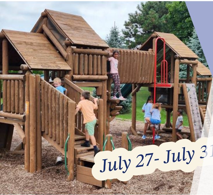
July 27 - July 31