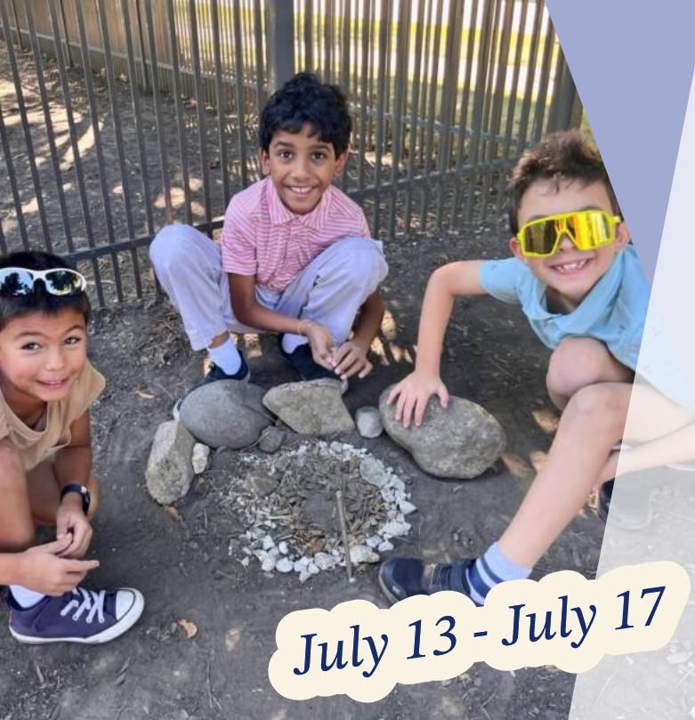
July 13 - July 17