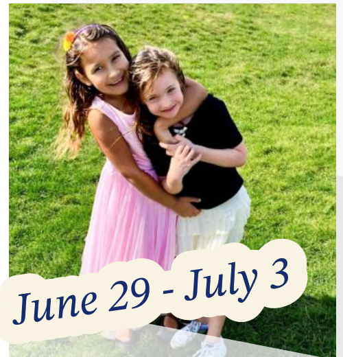
June 29 - July 3

During this week of summer camp, children will explore Earth and its natural wonders through hands-on discovery and scientific investigation. They will conduct exciting volcano experiments, observe clouds, learn about the water cycle, and investigate rocks and minerals through collecting and classifying activities. Later in the week, this learning will be enriched by a special visit to the Lizzadro Museum of Lapidary Art, extending their curiosity and deepening their connection to the natural world.