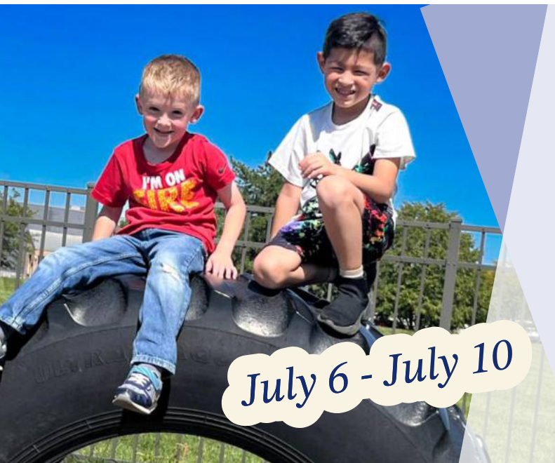
July 6 - July 10

Week 6 takes elementary campers on a joyful journey through Cultures Around the World, where they will explore global traditions through hands-on experiences and playful discovery. Through passport craft, international games, world music and dance, flag design, and cooking, children will build curiosity, appreciation, and respect for the diversity of our world. The week will also include a fun field trip to Sky Zone Trampoline Park, adding movement, excitement, and memorable summer adventure.